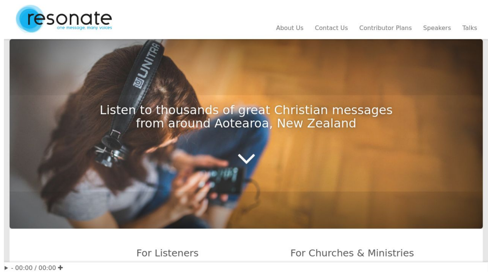
Resonate Sermon hosting site